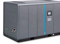
Oil Free Rotary Screw/Tooth