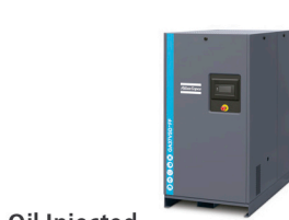
Oil Injected Rotary Screw